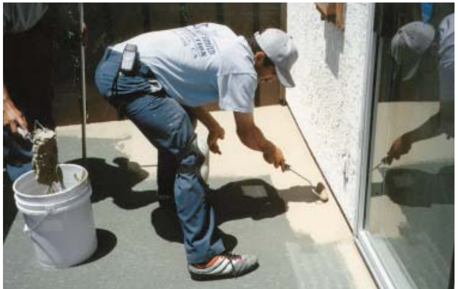
Figure 8. A final, acrylic color coat seals and protects the multilayered deck system from water absorption.