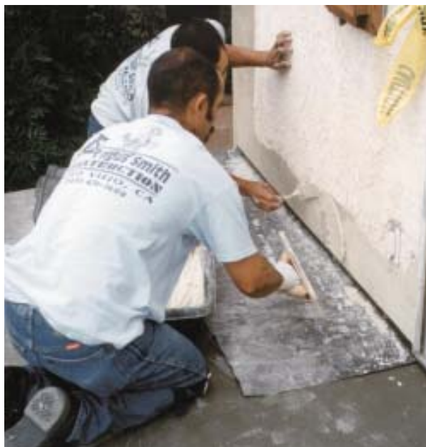
Figure 7. Stucco siding repairs follow the original three-layer process of scratch coat, brown coat, and color coat. A narrow strip of the sheet-metal flashing is left exposed to allow crack-free movement between wall and deck.

Once the texture coat can be walked on, we complete the patching of the stucco siding, following the original steps of 60-minute building paper, stucco lath (wire), scratch coat, brown coat, and a color and texture coat. Usually, we're patching small areas, so we use a quick-drying mortar mix to help expedite the job (Figure 7). We take the stucco down over the apron flashing but not all the way to the deck, leaving a narrow band of metal exposed. This allows for some necessary structural movement and elimi-