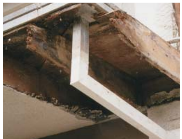
Figure 2. Improperly flashed scuppers (left) and floor drains (right) often allow water into the framing, leading to hidden rot.