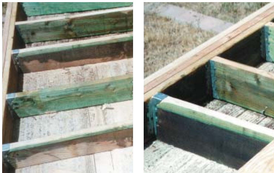
Figure 4. Joists that are too far gone to repair must be replaced between the wall plate and the new double rim joist (left). The rim hangs at the ends of the intact cantilevered joists on upside-down joist hangers. The replaced “cripple joists” are hung conventionally (right).

I gleaned this detail from a structural engineer many years ago, and it has proved to be reliable in practice.