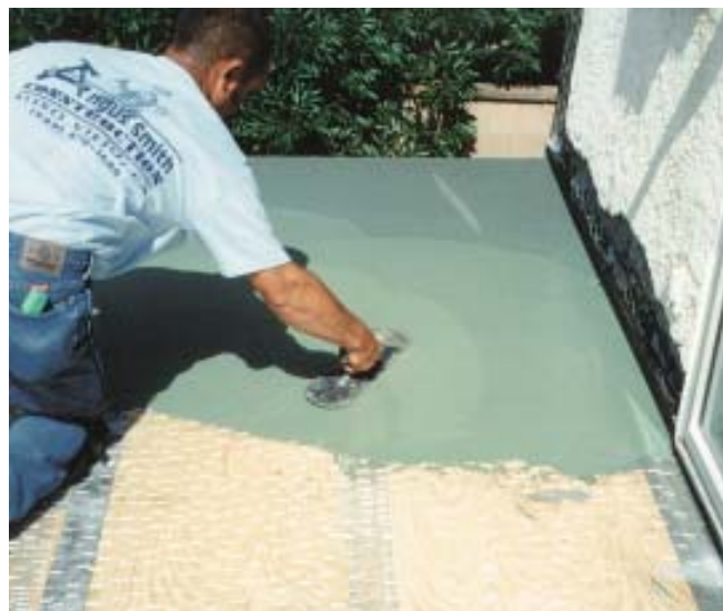
Figure 6. Galvanized expanded metal lath, thoroughly stapled to the plywood deck, reinforces the cementitious waterproofing membrane. Plywood expansion joints are isolated and protected from filling by a proprietary seam tape.

In replicating the original closed or open railing system, we pay strict attention to the sequence and detailing of the flashing. (Incredibly, we often find that the original flashing was mindlessly installed to trap rather than shed water.) Where the railing abuts the building, we break back the stucco