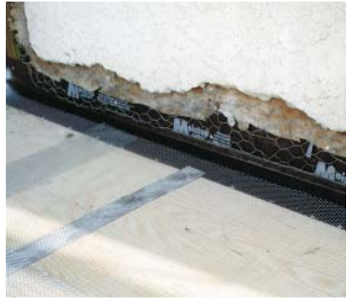
Figure 5. Flexible membrane flashing, tucked behind existing building paper and overlapping a sheet-metal skirt flashing, provides positive wall drainage onto the new balcony surface.

But obviously, it demands common sense and good judgment. If more than two in ten joists must be replaced, I'll consult an engineer. That also applies to another situation we sometimes encounter, where the damaged cantilever framing consists of a heavy beam at either end of the balcony with perpendicular infill joists running between them. In either case, it will usually be necessary to tear up the floor inside or post the balcony to the ground, but that's another story.