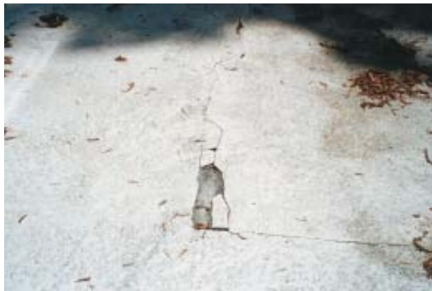
Figure 1. Surface cracks in a balcony's waterproofing are often the first sign of hidden structural damage. Cracks typically appear above joints in the plywood deck sheathing.

Railing systems are usually solid half walls rather than open assemblies,