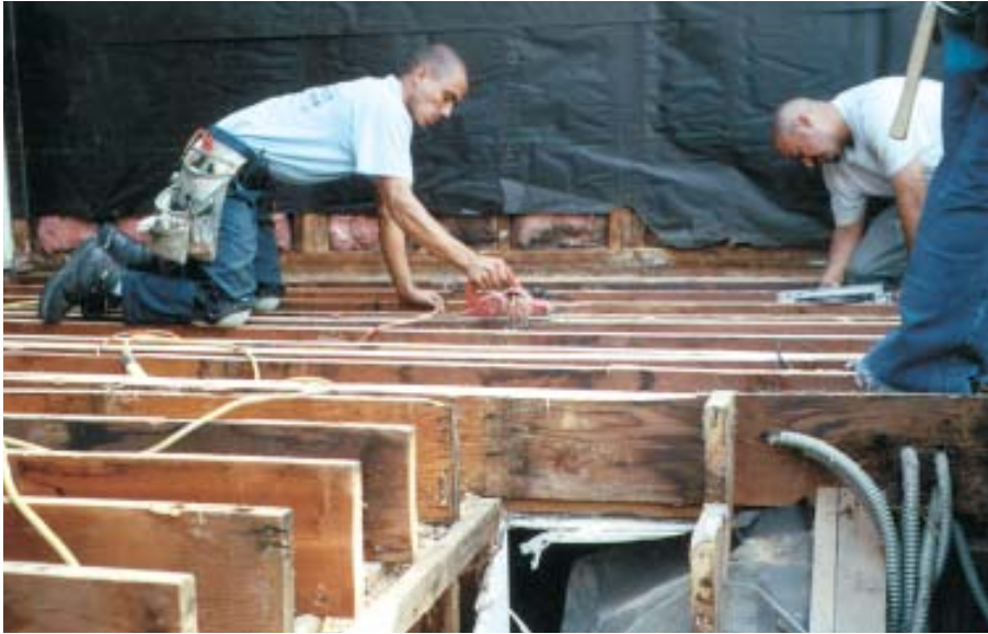
Figure 3. To eliminate puddling, the author rips a 1/4-inch-per-foot taper from the top edge of the cantilevered joists, creating a positive drainage slope. A power planer cleans up the cut.

rather than replacing them. Rot is often concentrated in the outermost 6 inches of the joists and along the upper edges, where nail penetrations have allowed water in. We cut the damaged ends back to healthy wood and sister new, 6-foot-long joists of equal dimension alongside, using two carriage bolts at the center and two at each end to tie the joists solidly together. To make a neater-looking repair and provide full nailing for the deck sheathing and trim, we fill in the end cuts with blocks of lumber.