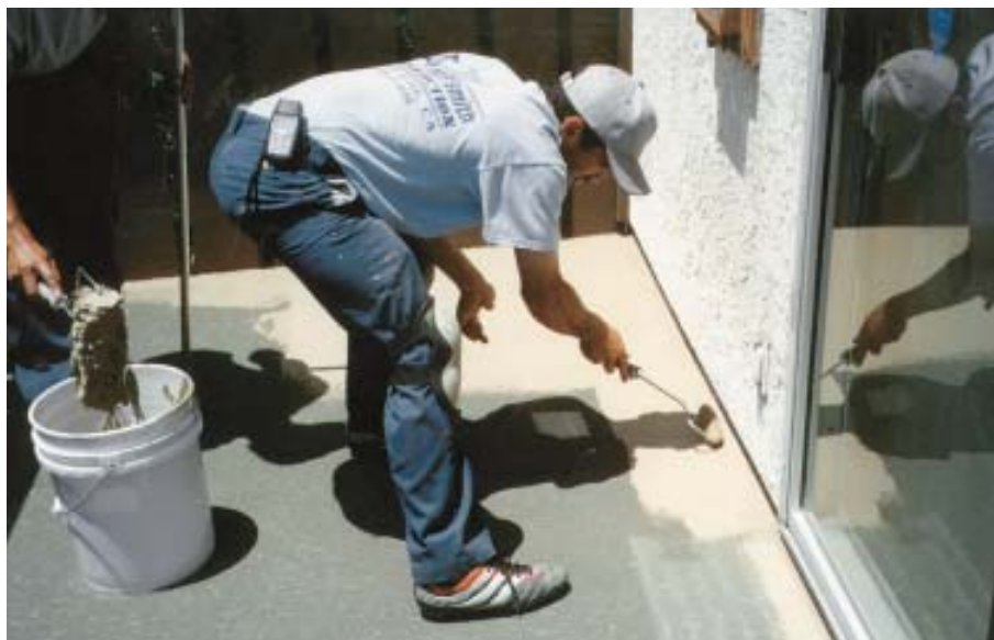
Figure 8. A final, acrylic color coat seals and protects the multilayered deck system from water absorption.